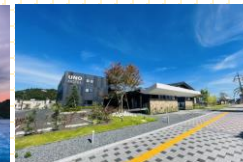
◇ UNO HOTEL