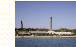
◇ Inujima Seirensho Art Museum - breathing new life into ruins of a former copper refinery