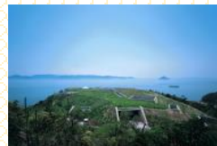
◇ Chichu Art Museum

Explore the Naoshima art scene before setting sail at 12:00 to enjoy lunch served aboard the yacht.