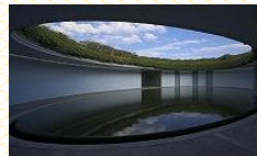
◇ Benesse House Oval