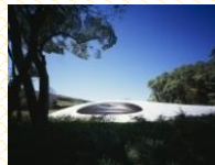
◇ Teshima Art Museum - design resembles water droplet at moment of landing.

◇ This is a commissioned tour. Itineraries can be customized to meet personal requests. Estimated price of model tour above includes local ground transportation on arrival at Okayama Airport, catamaran yacht charter, lunch (x2), hotel accommodation (2 nights, breakfast and dinner included), and museum admission. Airfare from Haneda Airport to Okayama Airport not included. For more information please contact us at Infinity Mugen - https://www.infinitymugen.com/ . Our travel design experts are available to assist you.