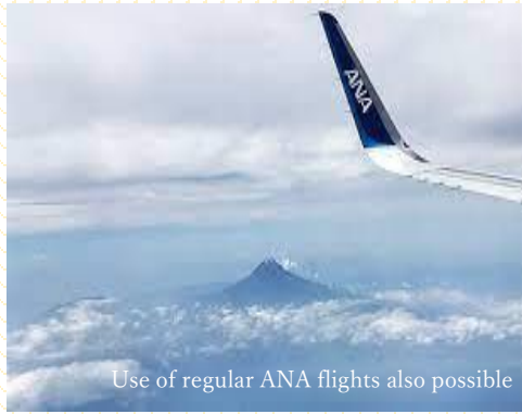
Use of regular ANA flights also possible

Explore the art of the Setouchi by catamaran ~ Art that blends with island beauty ~ Estimated price per person $6,620 (based on party of 6)*