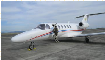
◇ Cessna 525A Citation CJ2+