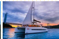
◇ Seto Ohashi Bridge tour