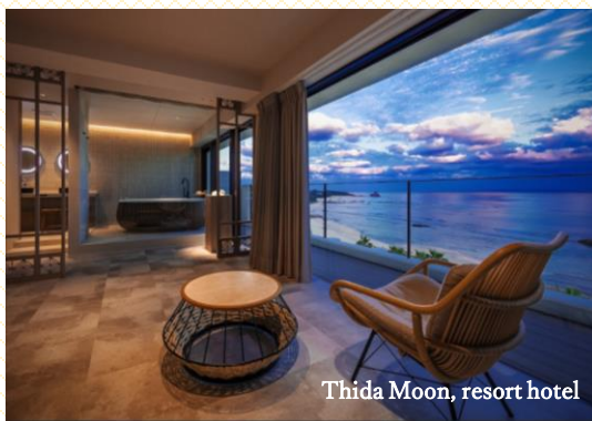
Thida Moon, resort hotel

◇ The tatsugo pattern, typical of Oshima tsumugi, is a geometric pattern inspired by the sotetsu palms that grow wild on Amami-Oshima. (Above) Dyeing using "getto" ginger.